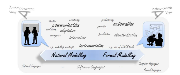
Fig. 1. Modelling and Linguistic Continuum

The concept of natural modelling is drawn from a fundamental understanding of the historical evolution of modelling practices, which is elaborated in [10], [11]. The space limitation does not allow us to provide here the details of this modelling retrospective. It follows the evolution and formalisation of symbols and languages used in modelling, depending on the modelling purposes, the needs of stakeholders and complexities of underlying social structures. Based on this, two fundamentally different, yet complementary, views on modelling are distinguished, namely formal and natural modelling (Figure 1). On the one side, formal modelling reflects the techno-centric view on modelling, and is focussed on automation, i.e. manipulation of models by machines. On the other side, natural modelling reflects a more anthropocentric view, and it focuses on the use and utility of models and languages for communication, collaboration and knowledge sharing. Therefore, it puts forward the modelling pragmatics. Based on [10], [11], the basic principles of natural modelling are: