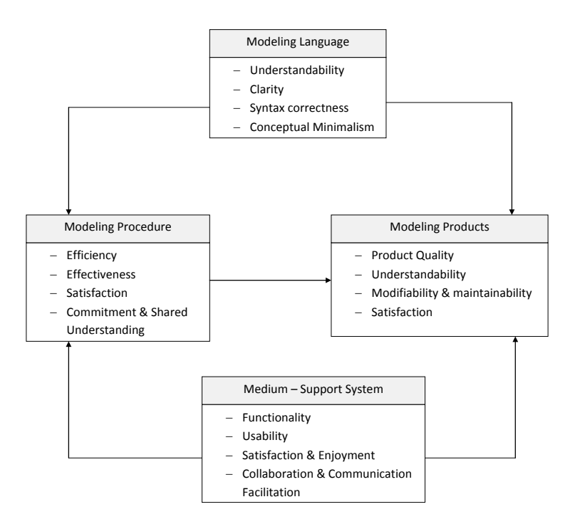
Fig. 1. Mutli-criteria evaluation framework for modeling process artifacts

approaches used to solve the problem, the intermediary and end-products produced and the medium or support tool that may be used to aid the collaboration. All these do impact on the quality of the modeling process and need to be evaluated if we are to understand, measure and assess the quality of the modeling process. Figure 1 shows our evaluation framework for the modeling process artifacts with their (selected) attributes and the cause-effect relationships indicated by the arrows. The definitions of the attributes are given in [25].